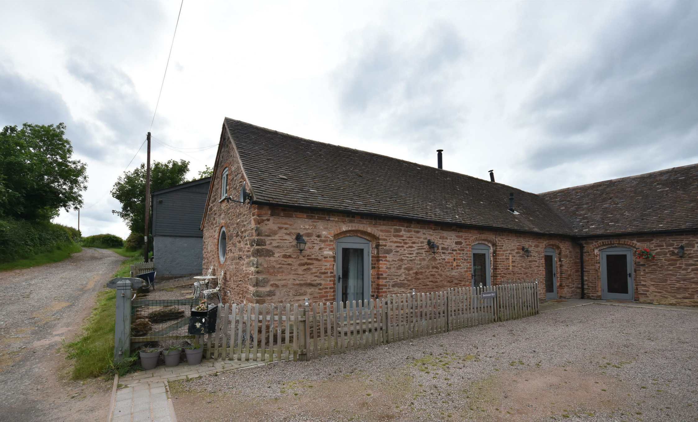
1 Binnal Barns, Nordley, Bridgnorth, Shropshire, WV16 4SU